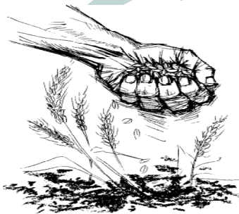
We plant seeds and He nurtures throughout the seasons.

emphasize memorization with children, but we strive to form ALL disciples throughout the different phases in life. While teaching children prayers, Mass etiquette and the symbols of our Sacraments is still important, even more crucial is the need to introduce children AND adults to an experience of Jesus Christ.